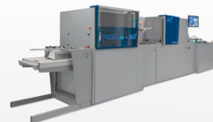
JV3DS Digital & Commercial Print