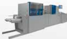
JV3DS Digital & Commercial Print